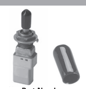
Part Numbers 49-4307 and 49-4308